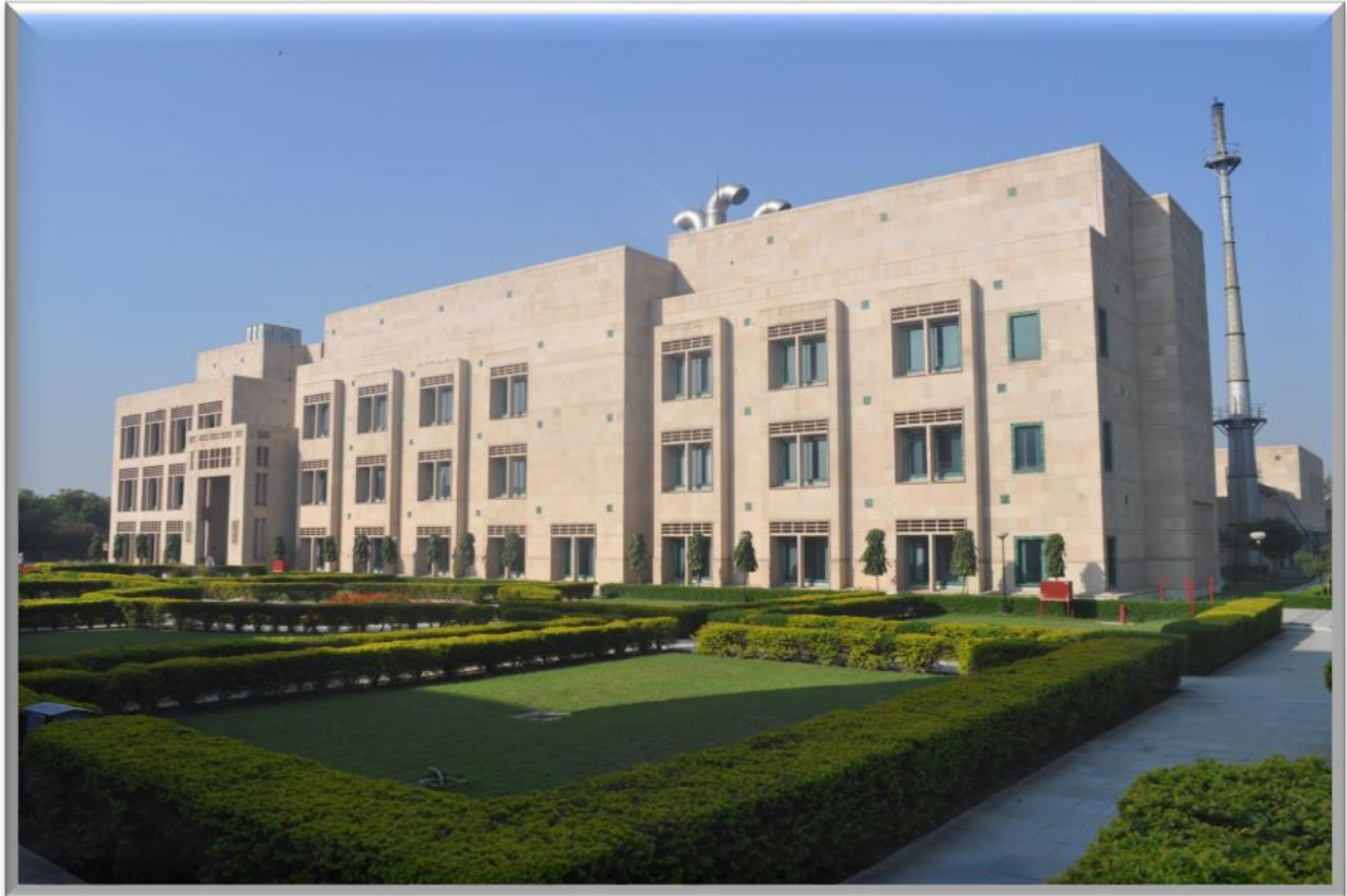
National Institute of Biologicals- National Coordinating Centre (HvPI)